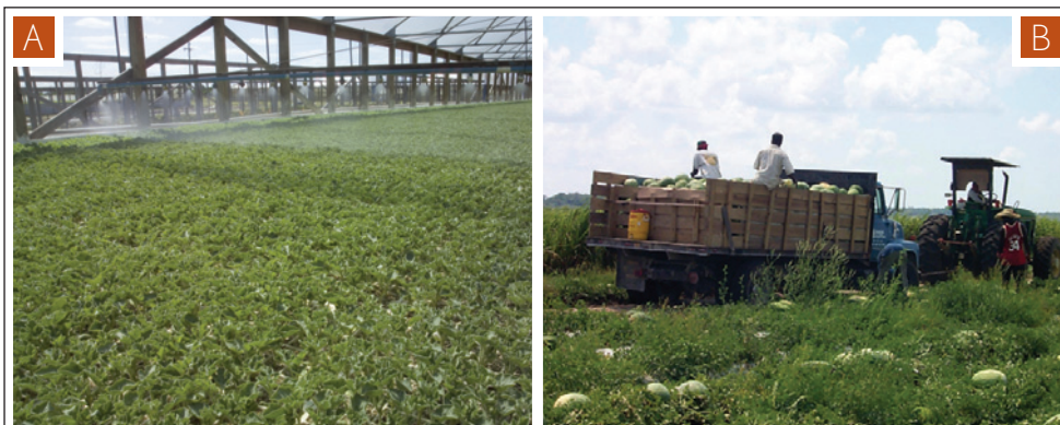
Figure 1. Production practices play a big role in the spread of the bacteria causing BFB. A) Overhead irrigation is a key factor in the spread of bacteria in the greenhouse. B) Equipment can spread the problem from field to field.