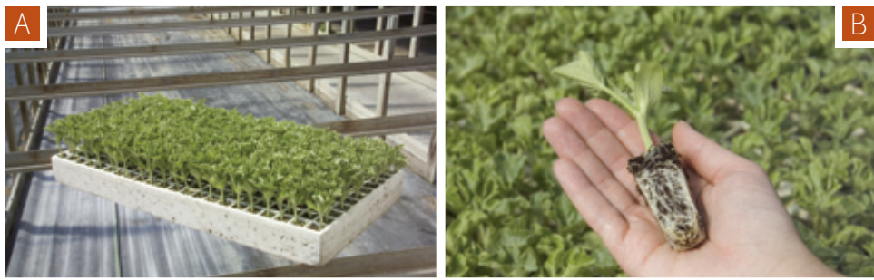
Figure 2. A) Foliage of healthy watermelon seedlings. B) Root system of a healthy watermelon seedling.