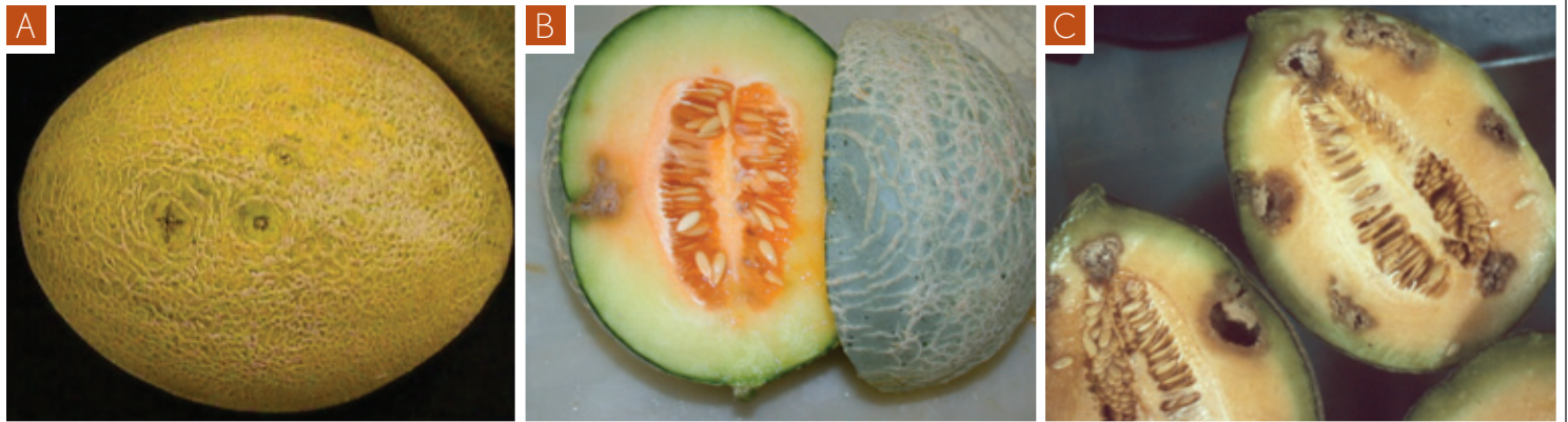
Figure 6. A) External BFB symptoms on a cantaloupe fruit. These symptoms include small depressed pin-point lesions and cracks. These may be misinterpreted as insect damage. B) Early external and internal symptoms of BFB on cantaloupe fruits. Netting fails to form over the pin-point depressed surface lesion but the rot penetrates from the rind into the flesh of the fruit. C) Advanced internal BFB symptoms on cantaloupe fruits including pits and rotten cavities that penetrate from the rind into the flesh of the fruit.

foamy ooze often can be seen on the fruit surface and fruit decay often follows. On melon and cantaloupe fruit, BFB symptoms include small pinpoint lesions that do not expand on the surface of the fruit, however, extensive internal fruit decay can occur. Cantaloupe and melon fruit symptoms may be difficult to detect visually because they often appear as small sunken lesions, easily mistaken for insect injury. However, BFB can result in complete internal fruit rot.