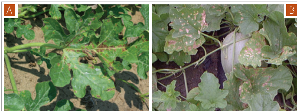
Figure 4. A) BFB symptoms on mature watermelon leaves. B) BFB lesions on cantaloupe leaves. Note the tan to white appearance.